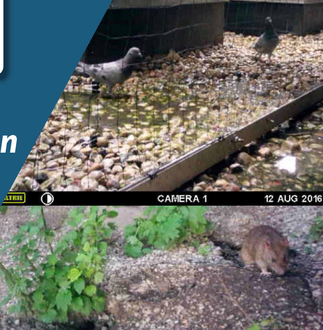
Top: Pigeons entering roof of client's building through hole in fence, Bottom: A large rat infestation in a local city